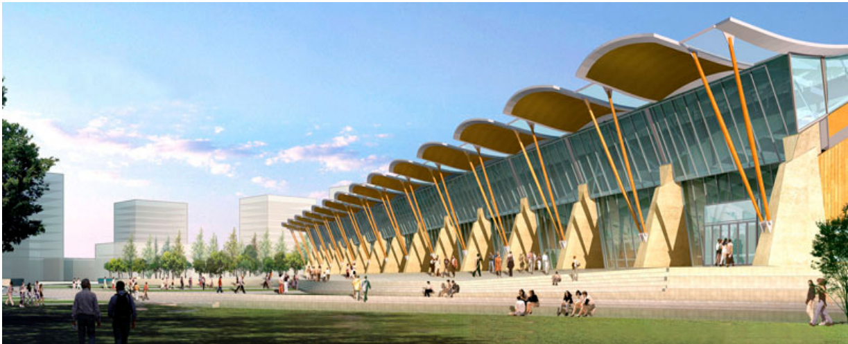
Richmond Olympic Oval: Opened 2008